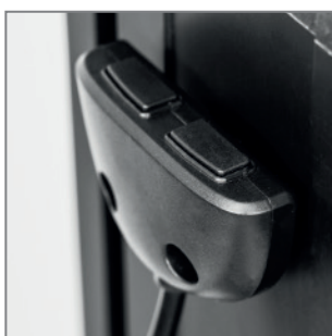
wired touch control