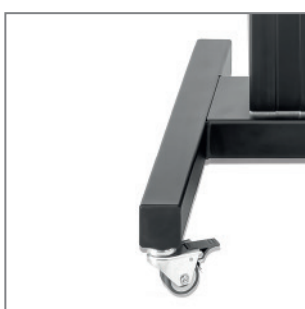
castors with lockable brake